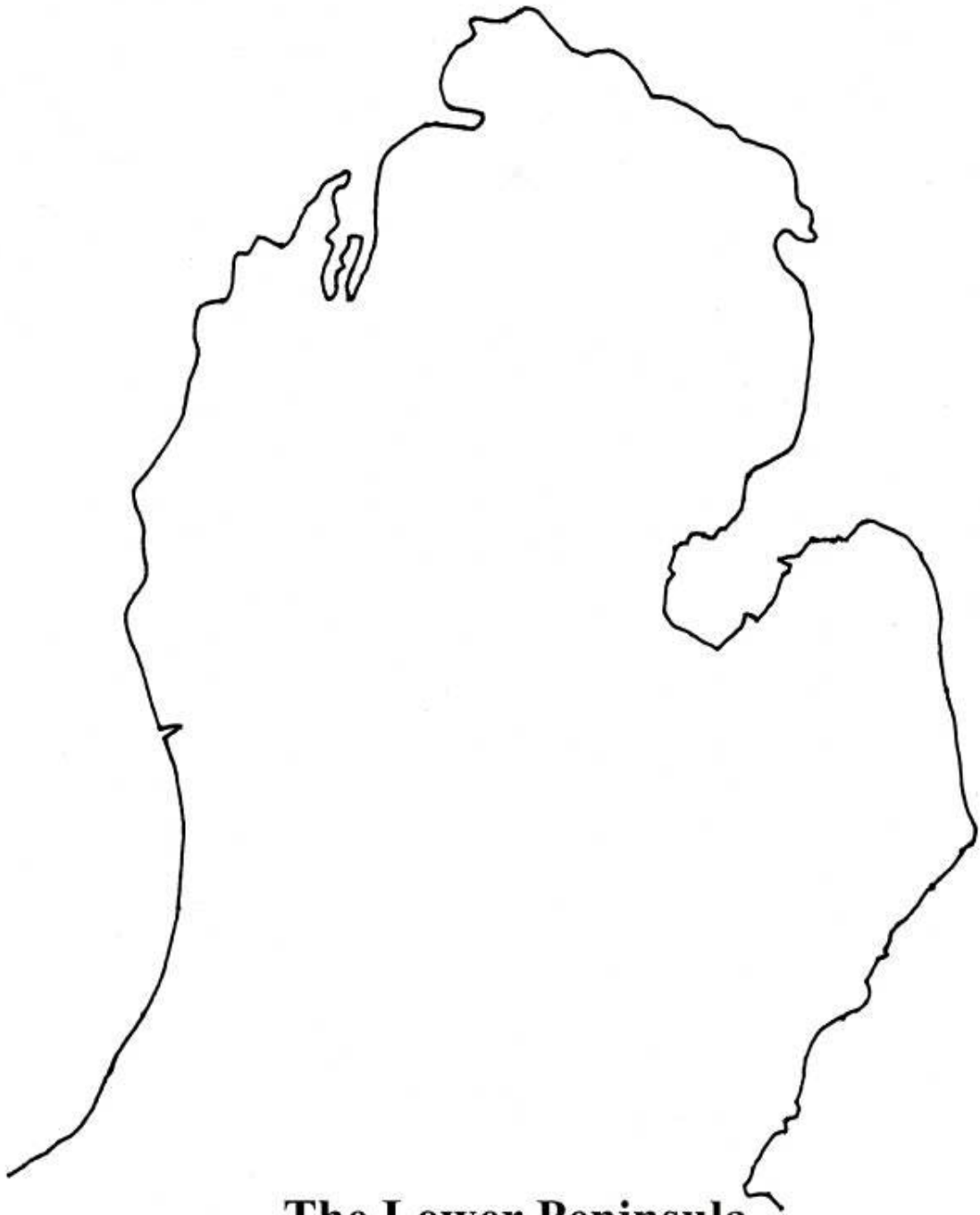
The Lower Peninsula of Michigan