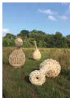
Grand Gathering | Karen Gubitz | East Gardens Mystical seedpods are hand-woven together with trees, the trees appear to come out of the seeds while the seeds appear to grow out of the trees, exemplifying the circle of life. This temporary installation is a fiber sculpture. No glues, nails, tape, tacks or other forms of attachment were used in this sculpture.

This piece strategically places life-sized historic photographs throughout Grand Rapids where they were originally taken. It gives observers new perspective on transformation in our community. The GRPM is one of five locations where ArtPrize visitors can view this work.