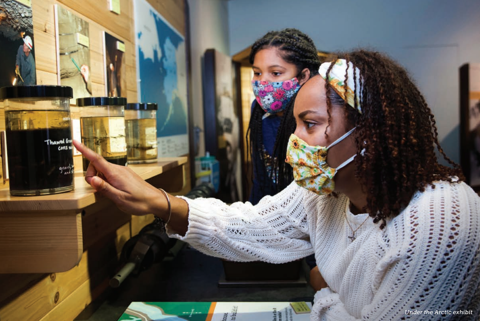
Under the Arctic exhibit