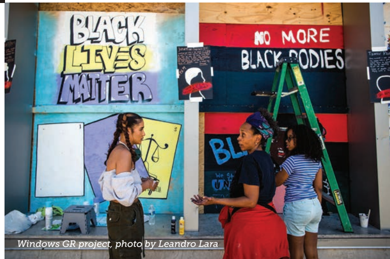
Windows GR project

The Museum purchased three paintings by local artists of color as part of the Windows GR project. Windows GR was a public activation project created to paint boarded-up windows in downtown Grand Rapids over the summer. In response to the death of George Floyd, police brutality and systemic racism, this project aimed to highlight black voices and stories. Three of these works are now part of the GRPM's permanent Collections and will be on display at the time this report is printed.