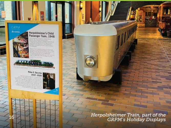
Herpolsheimer Train, part of the GRPM’s Holiday Displays

Fiscal year: July 1, 2019 - June 30, 2020