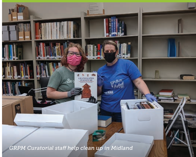
GRPM Curatorial staff help clean up in Midland

Six GRPM staff were recognized with an award from the MMA for their efforts in assisting with cleanup at the Midland and Sandford museums after the disastrous flooding in Central Michigan this spring.