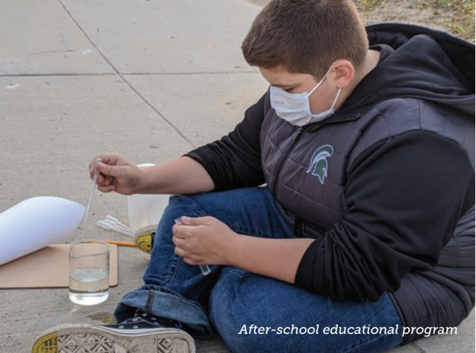
After-school educational program