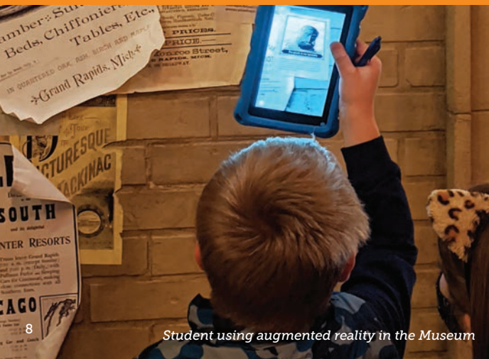
Student using augmented reality in the Museum