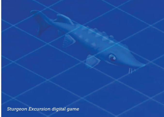
Sturgeon Excursion digital game

The GRPM has partnered with YETi CGI to develop a state-of-the-art digital learning platform to connect Museum learners with exhibit stories. An augmented reality experience is being built within the GRPM exhibits, allowing learners to explore and interact with the history, culture and science of their environment through smartphones or tablets equipped with an internet connection and a camera. Upon the Museum's closure in March 2020, the project team rolled out a web-based game experience, Sturgeon Excursion, that targeted the same learning outcome for students accessing the game off-site. Students can play from any location on any browser. Within this game, learners meet the mighty lake sturgeon, learn about the cultural history of this area and find out a few ways to care for the quality of the Grand River watershed. Players answer questions and gather food for their lake sturgeon avatar, allowing it to grow and travel down the Grand River on its journey to Lake Michigan. The goal is to have both in-person and off-site versions available.