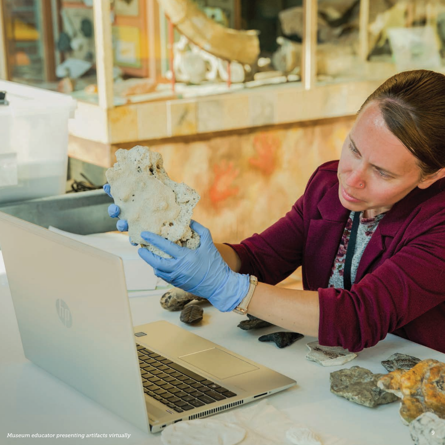
Museum educator presenting artifacts virtually