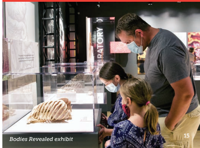
Bodies Revealed exhibit

Outbreak: Epidemics in a Connected World