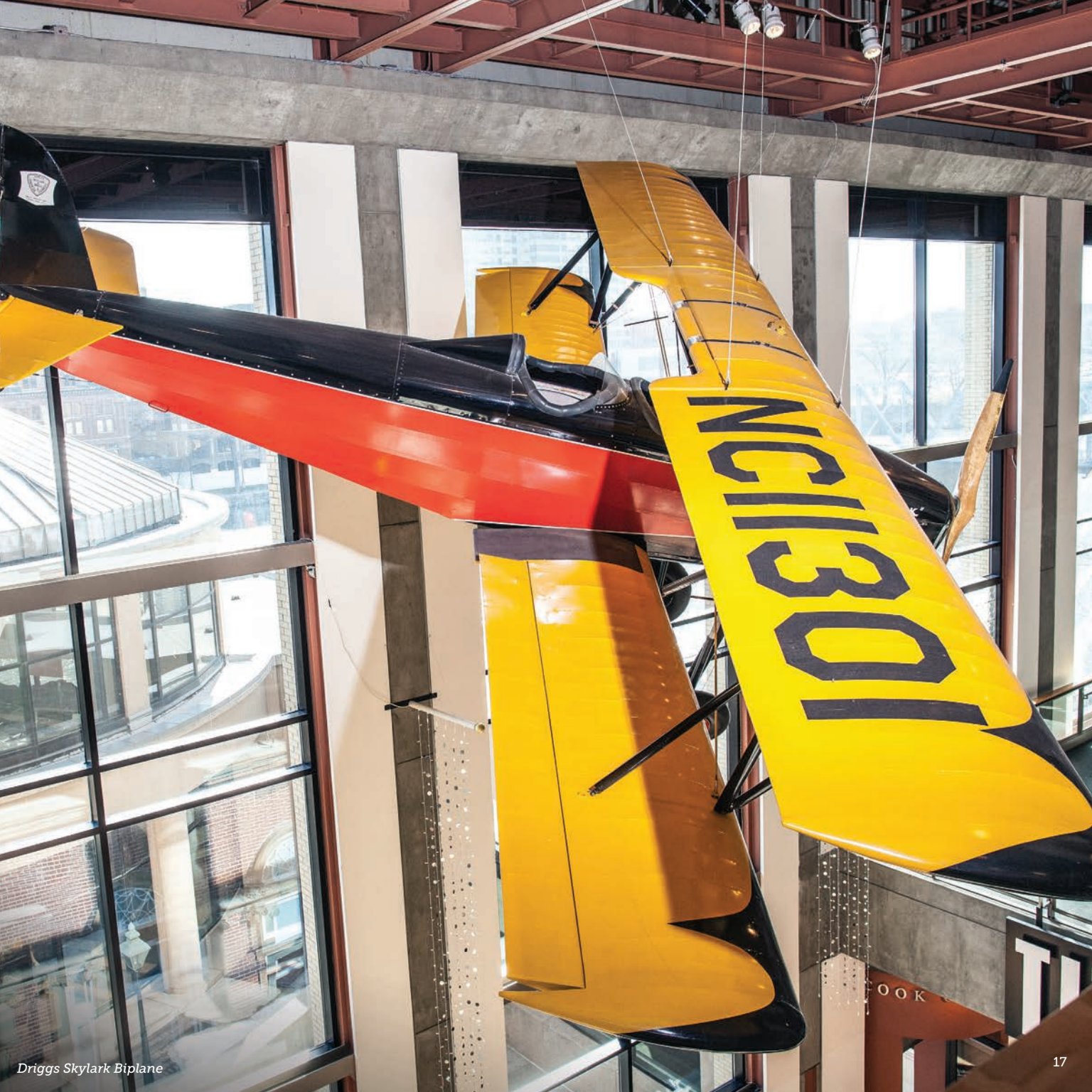
Driggs Skylark Biplane