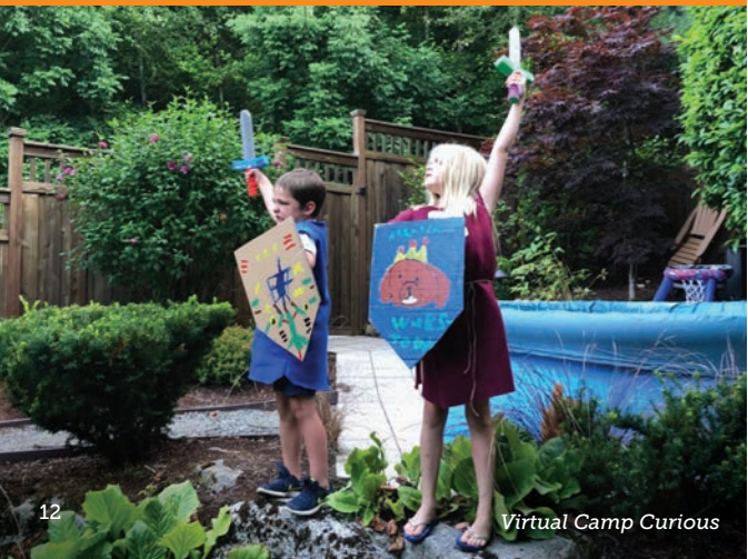
Virtual Camp Curious

Over 200 campers participated in the first-ever virtual Camp Curious. The Museum was able to offer engaging and educational camp experiences for families through web-based interactions. From behind-the-scenes tours to experiments and exploring artifacts, campers were able to participate in a wide variety of activities. Camp content was also shared with new partners D.A. Blodgett - St. John's residential care clients and Helen DeVos Children's Hospital.