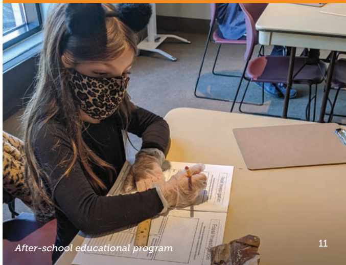
After-school educational program

accessed the Collections, including Museum School students