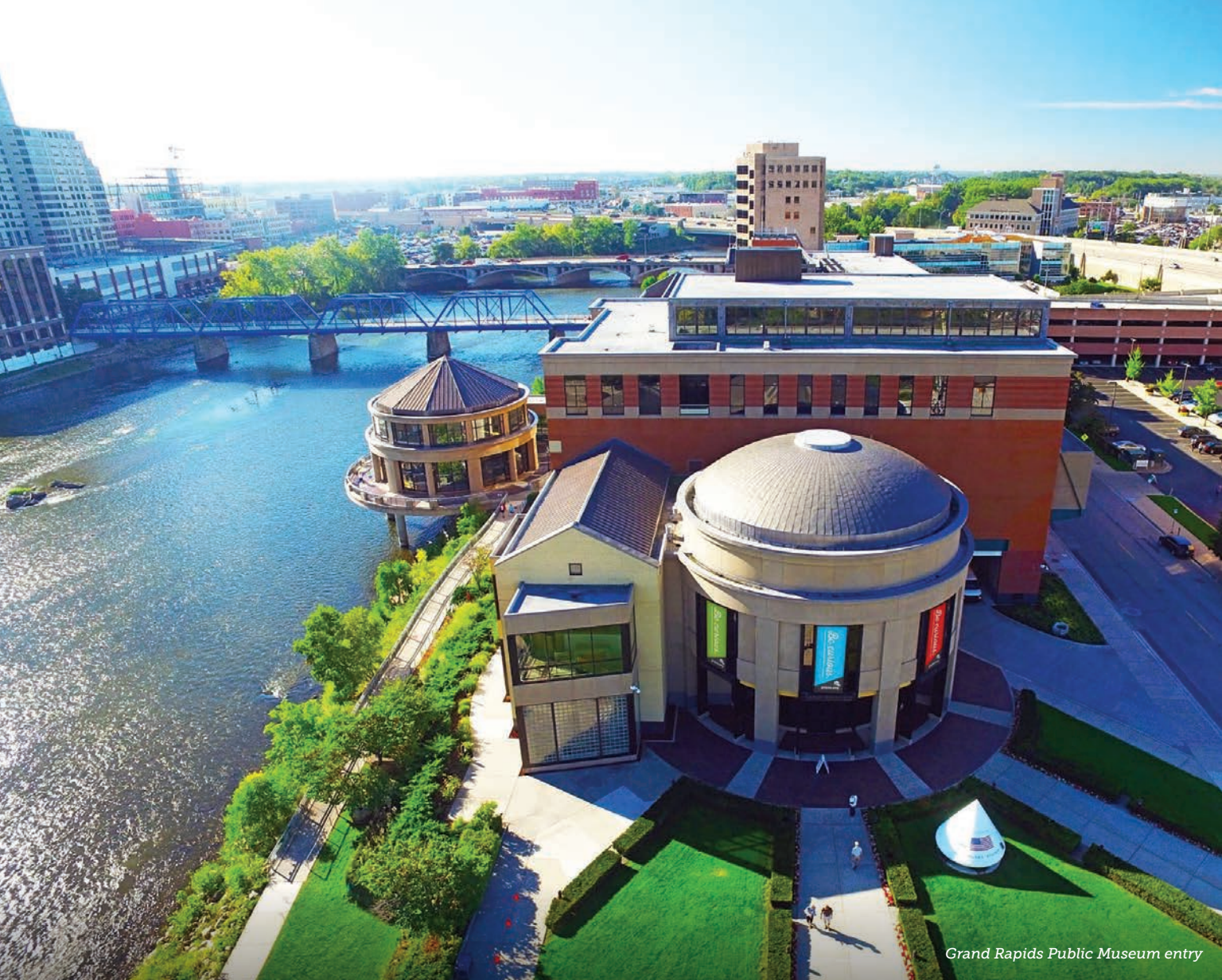
Grand Rapids Public Museum entry